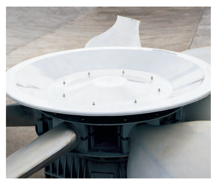
The HP7000 seal disc design helps enhance aerodynamic efficiency

Full scale close-up views of other manufacturer and Marley HP7000 fan blade samples after 300 hours in the same erosion test chamber.